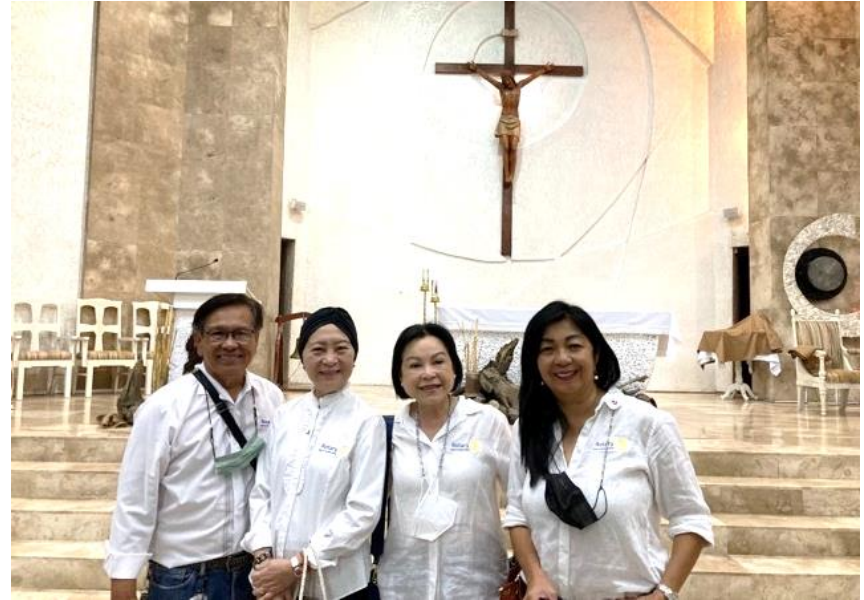
Anticipated Mass... Feb. 25, 2023, Assumption Church