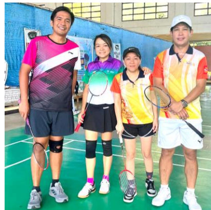
Badminton Game... Feb. 25, 2023 Crocodile Park